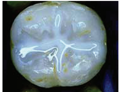
Tooth WITH fissure sealant