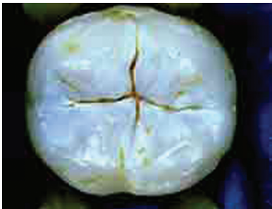
Tooth with NO fissure sealant.