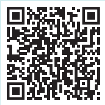
Autism Little Learners Social Stories