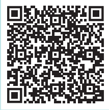
DentalHealth.ie 'Tom Goes to the Dentist'